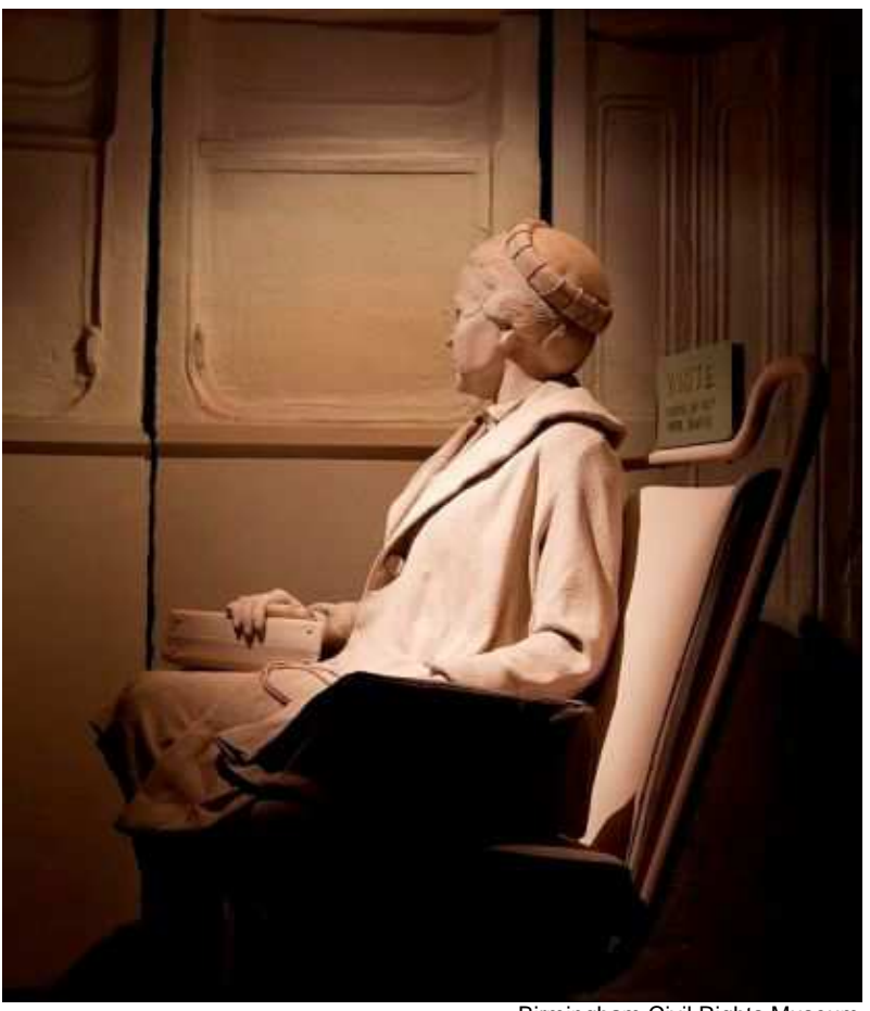
Birmingham Civil Rights Museum