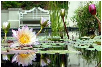
Alabama Museum of Art