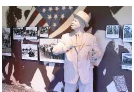
Birmingham Civil Rights Museum