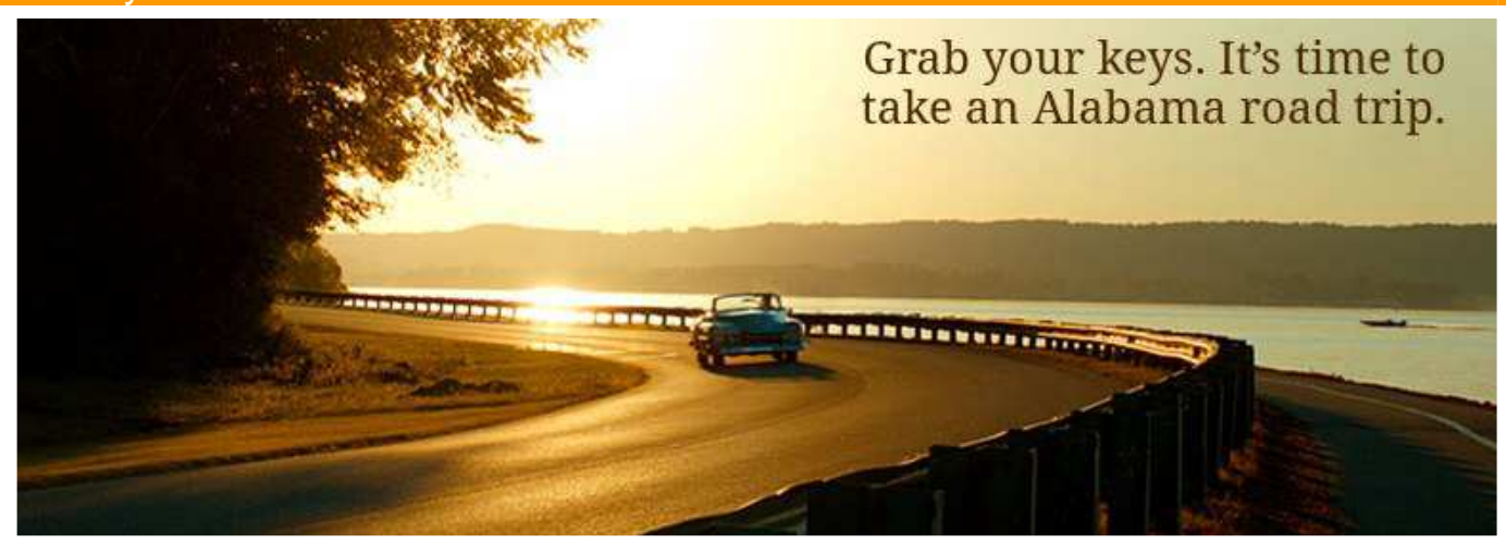
This AllWays traveller to Birmingham, is one of five AllWays traveller features in the Alabama series.